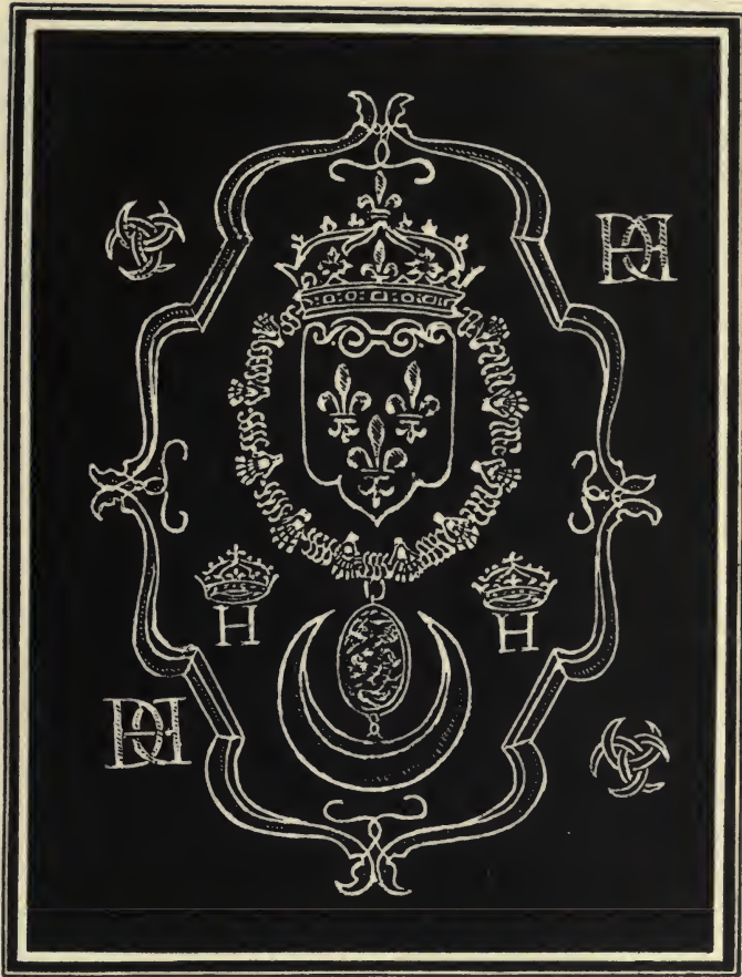
HENRI II AND DIANE DE POITIERS.